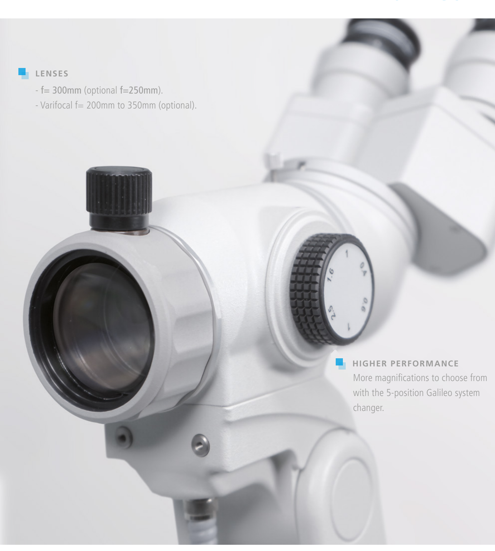
"MAGNIFYING IS THE ART OF APPRECIATING THE SMALLEST THINGS."